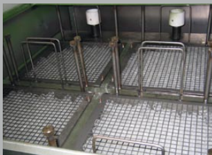
Detailed view: View of media basket

The LFOS system works in accordance with the law of "relative penetrability of different liquids through retaining bodies". The retaining bodies are located in the media basket and are durable almost indefinitely. The retaining bodies can be washed out in the event of strong contamination.