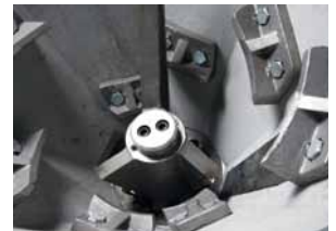
Crusher chamber with crusher shaft

The chips are torn into small pieces by the rotation of the crusher head. The chips are gradually guided downwards through the crusher chamber. The final crushing occurs in the lower part