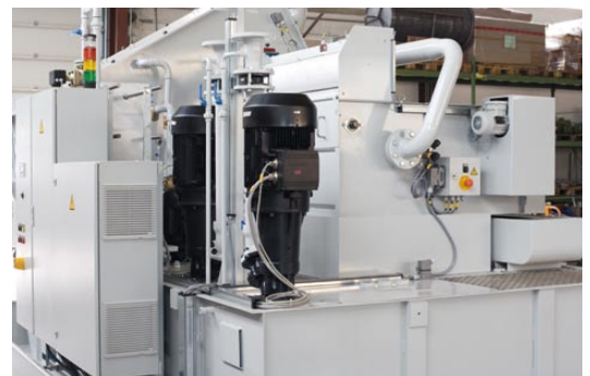
Deep-bed filter with fabric on combined system